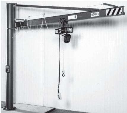
Pillar jib crane PS