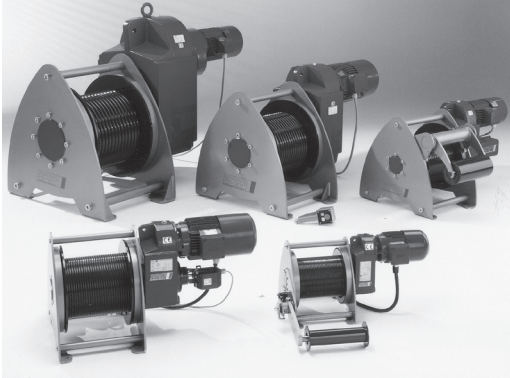
Wire rope winches, electrical