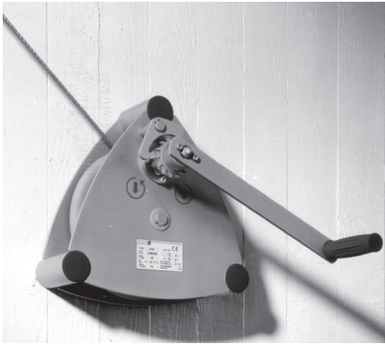
Wall mounted wire rope winch 'ALPHA'