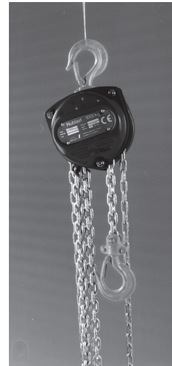
Hand chain pulley block ProLine P 90

Further product fields: Hydraulic lifting platforms Wire rope hoist Electric chain hoists